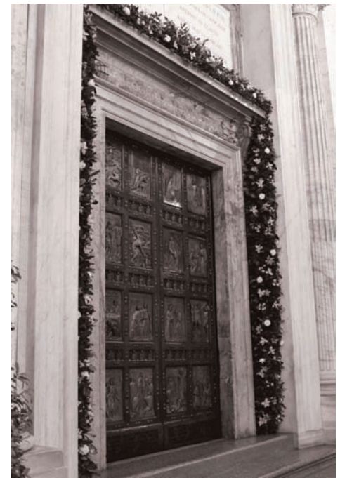
Holy Doors at St. Peter's Basilica, Vatican City

As we enter into the month of May and draw close to Holy Mother, Mary, conceived as a pure act of love, free from Original Sin, may her intercession bring us into deeper communion with Her Son and as a holy people in His name.