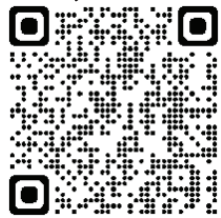
Scan to learn more

Each year, over 1,000 young girls, ages 5-13, with financial or domestic hardship enjoy a subsidized joyful camping experience at Marygrove, a residential camp situated on Georgian Bay in Ontario. Families who are experiencing financial or domestic hardship may contact the Society of St. Vincent de Paul directly