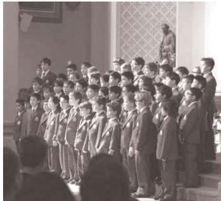
The Elementary Choir sings at St. Paul's Basilica, October 17th, 2014.

known for music of the highest caliber. For tickets and information, visit masseyhall.mhrth.com/ or scan the QR Code.