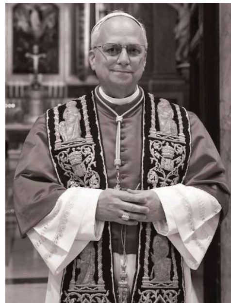
Habemus Papam! Pope Leo XIV named 267th successor of Peter.

Discussions can at times be vigorous but always need to be respectful. When speaking, we need to prominently include the goals we are pursuing, and perhaps, the person we are talking to can actually shed more light on them. If we were to do this with our relationships inside the Church, it would be far easier for us to articulate a message that is faithful to the vitality of the new life that Jesus invites everyone to. We would be a much stronger sign to the world.